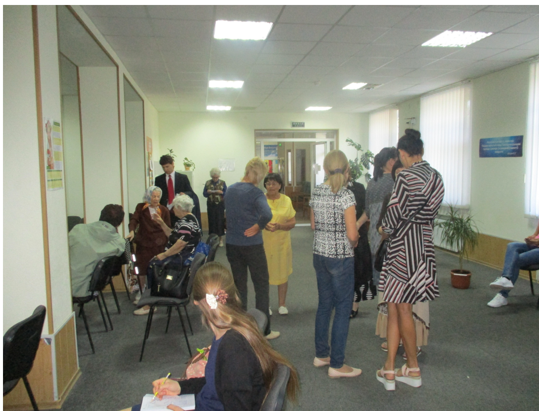
Visiting before services.