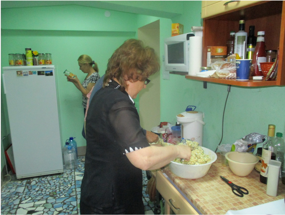
Puttin it all together.