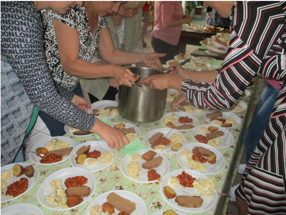
OH! It was good.